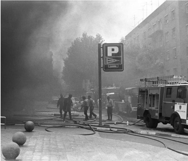
Firefighters try to access the interior of the Hipercor shopping centre carpark after an ETA attack (Barcelona, 19/06/1987).

At the beginning of the 1980s, democracy was consolidated in Spain. With it, a path of European integration and economic, social and cultural modernization began. But it continued to face different terrorist threats.