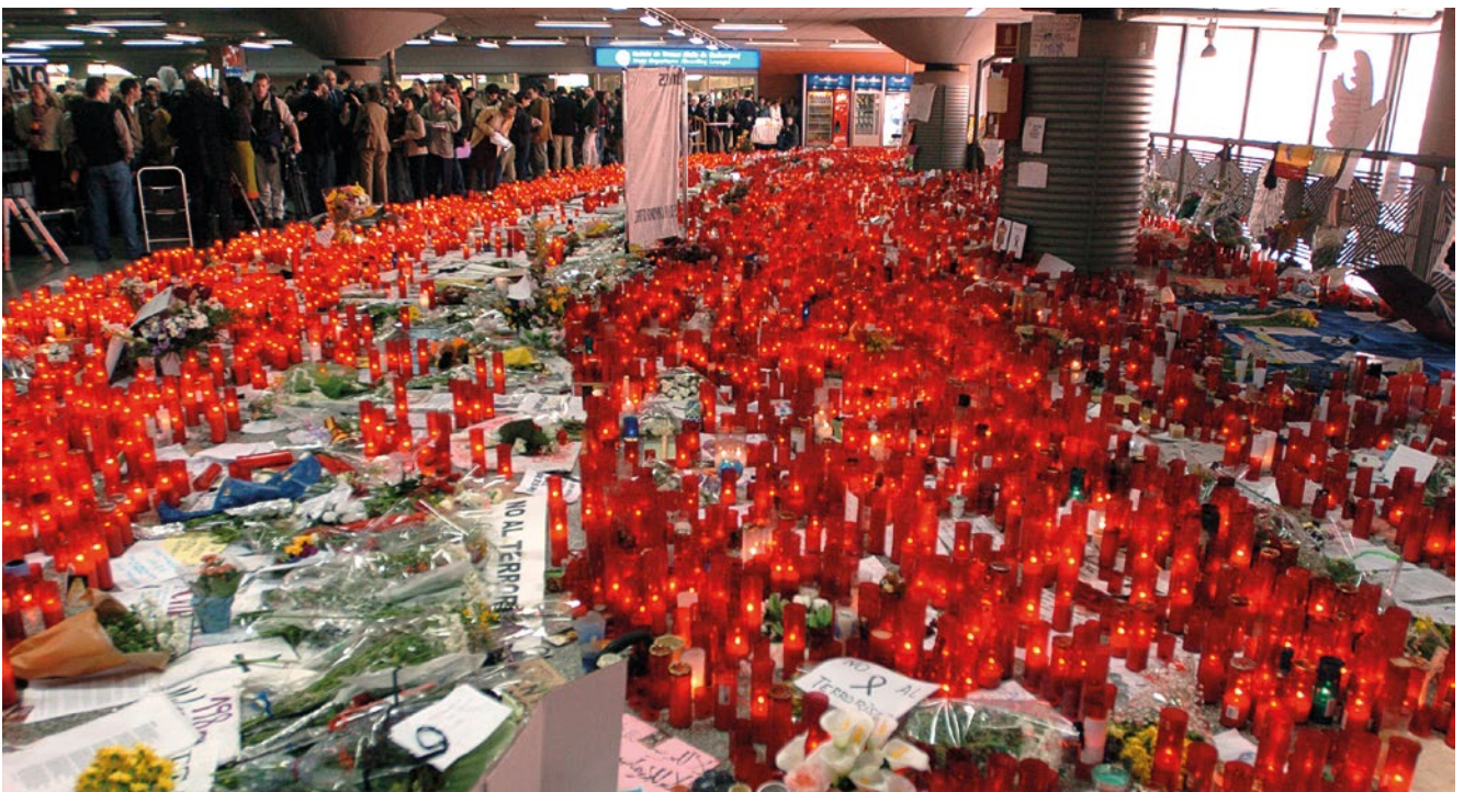
In memory of the victims of 11-M at the Atocha train station, organized by the Spanish Victims of Terrorism Foundation together with other groups, associations, and foundations of victims of terrorism. Madrid, 18/03/2004.

But the 21st century opened with another threat: jihadism. Such groups had already committed acts of terrorism previously in Spain, for example with the use of a bomb in the restaurant El Descanso in Madrid, where 18 people died.