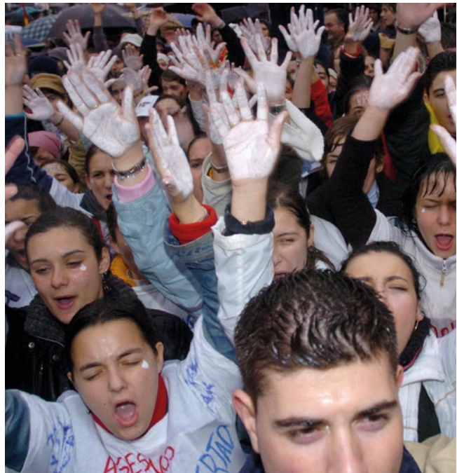
Dozens of people show their white hands during the demonstration that was convened in Madrid the day after the attacks of 11th March 2004 under the slogan "With the victims, with the Constitution, for the defeat of terrorism".

Terrorism has also led to the existence of another type of victim: the threatened. ETA is the group that has caused the greatest number of threats. People who lived with the anguish of suffering an attack had to abandon their homes to get to a safe place in another part of Spain. Some were threatened by the fact of belonging to certain collectives that were in the sights of ETA (members of the Police Armed Forces, public officials of constitutional parties, journalists, teachers, businessmen, judges, intellectuals critical of terrorism, amongst others). Other people threatened included those who refused to pay extortion to ETA or found themselves being accused by the terrorists of anything that made them worthy of an attack, such as being accused as enemies of the Basque people. The terrorist threat, what was called "persecution violence," forced thousands of people to live with police protection for many years and forced others to leave their homes, cities, friendships, hobbies, and work to go into exile.